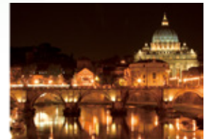
Dynamic Contrast Ratio